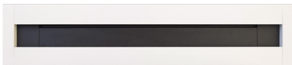
Type 6 Air Bar Surface Mount with Duct Mounting Brackets