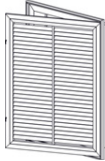
F - Hinge