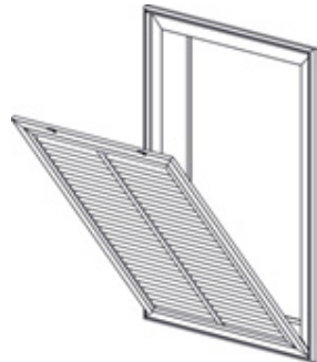
H - Hinge