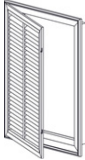
E - Hinge Standard