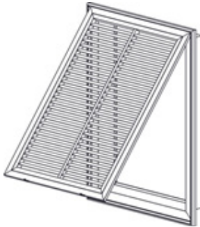
G - Hinge