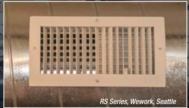
RS Series, Wework, Seattle