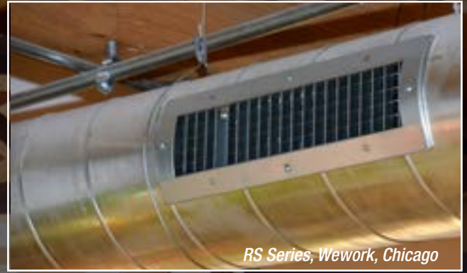
RS Series, Wework, Chicago

The most comprehensive spiral diffuser offering in the HVAC industry.