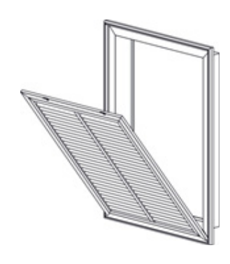
H - Hinge