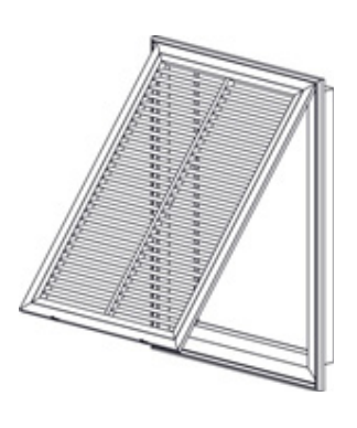
G - Hinge