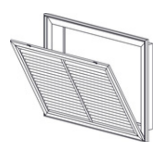
A - Hinge Standard