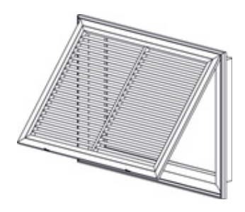
B - Hinge