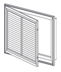
D - Hinge