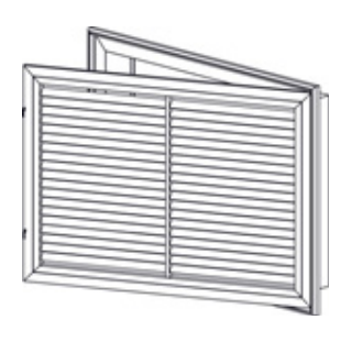
C - Hinge