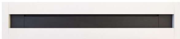
Type 6 Air Bar Surface Mount with Duct Mounting Brackets