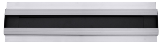
Type 3 Air Bar Tape and Mud 1 Slot Before Install